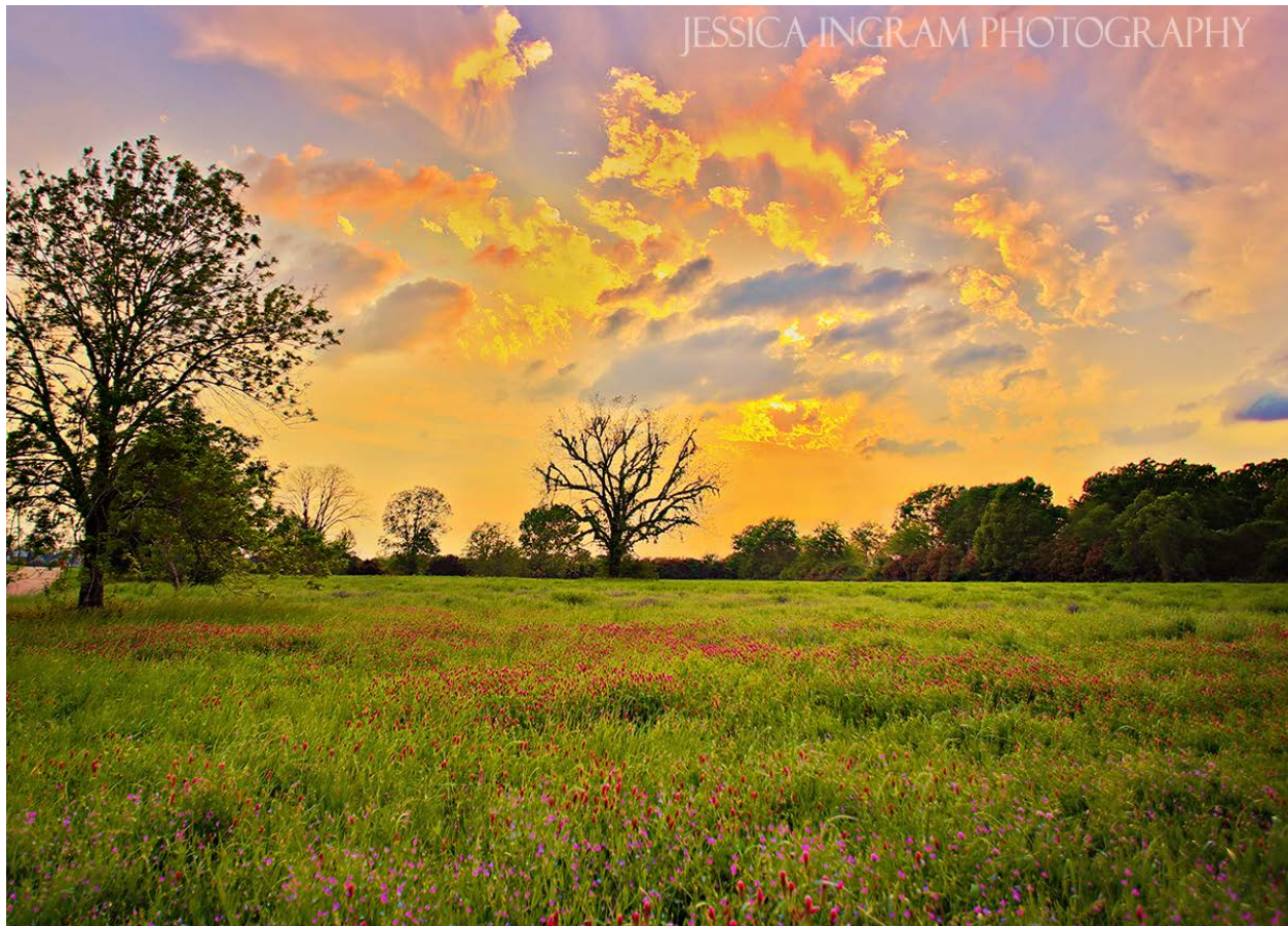
Jessica Ingram Field of Dreams 2

Forever reshaping and changing what it means to be me— I shall forever be all things and nothing at the same time, For I am not yet dead, Nor shall I ever truly be.